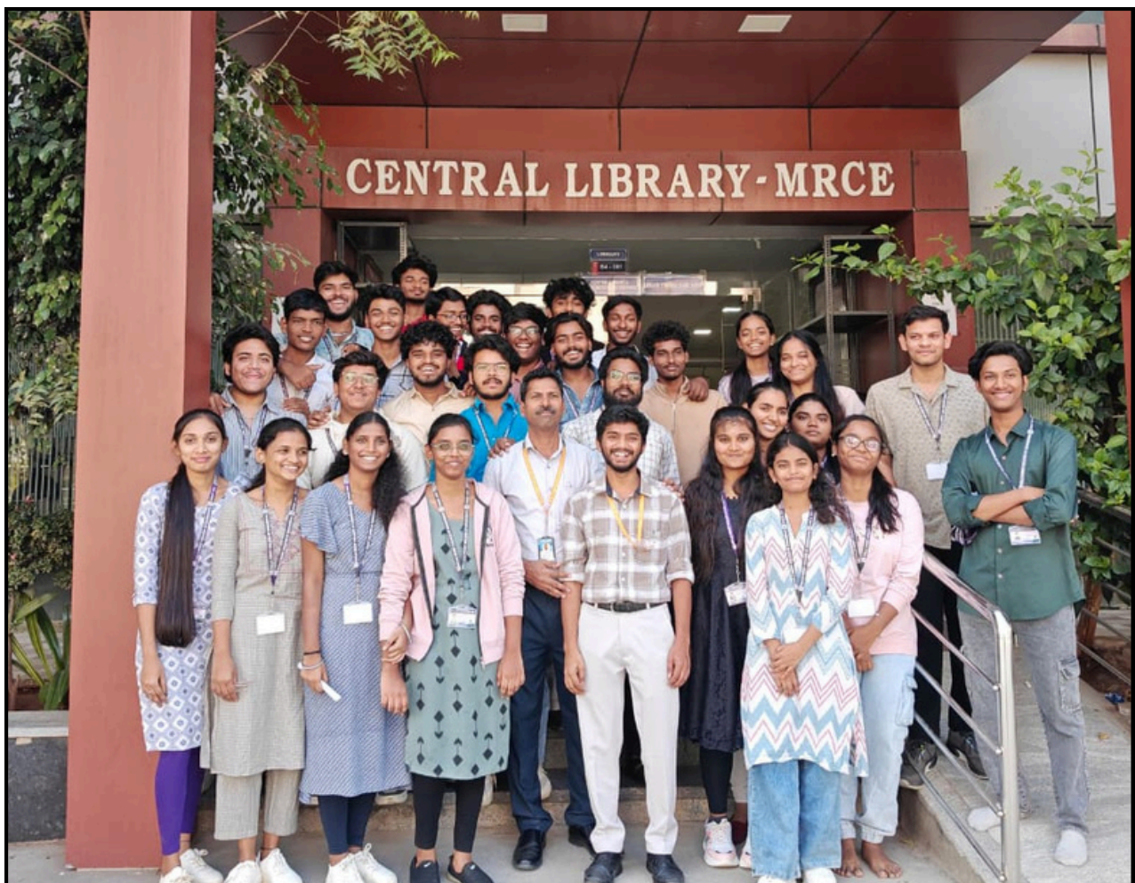
STUDENTS COORDINATORS, THE ILLUMINATORS

Students from all first-year branches expressed great enthusiasm throughout the event. Many shared that they enjoyed the rare chance to read something unrelated to coursework and to express their understanding creatively. The activity sparked curiosity about visiting the library more often, exploring new genres, and developing the habit of reading regularly. Several students mentioned that this event helped them rediscover the joy of reading, and many felt a sense of achievement after completing their written reflections. The event also built a sense of academic community among first-year students who interacted with peers from different departments.